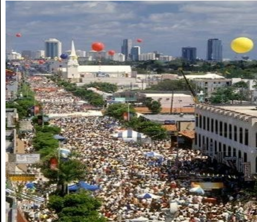
Calle Ocho Festival in Miami