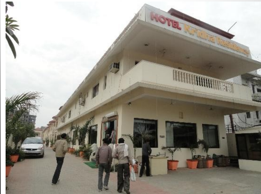
Kridha Residency Exterior View

Shree Yamuna Maharani Suite, Price are Rs. 12,500- Rs. 18,500.