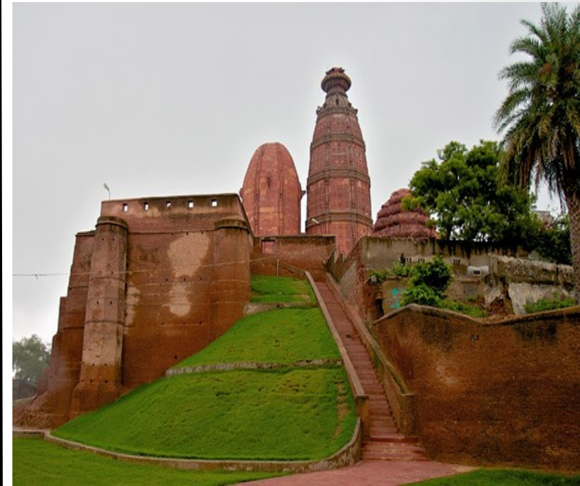
Madan Mohan Temple Vrindavan

The name 'Vrindavan' is derived from 'Vrinda', another name for the sacred tulsi (basil) plant. It is said that the entire place was a tulsi grove at one time. According to another tradition, it was named after Vrinda Devi, one of Krishna's consorts. The earliest known shrine in Vrindavan is said to have been built by the local Gosvamis in a large garden called Nidhiban. According to tradition, Mughal Emperor Akbar was taken blindfolded inside the grove where he had some kind of a spiritual experience. As a result, he acknowledged the spot as being holy ground. The four temples that were built in honor of his visit are Madan Mohan, Govinda Deva, Gopinath, and Jugal Kishore.