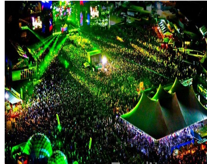
Nightlife in Miami is Amazing

Miami's hub for all things nightlife, south beach is a great place for music lovers. Here, you'll find the legendary mango's tropical cafe on ocean drive. A vibrant bar featuring lively dancers with colorful costumes, mango's is open until the wee hours of the morning, every night of the week. The fillmore miami beach at jackie gleason theater is a popular concert venue that brings both national acts and local singer-songwriters to the stage.