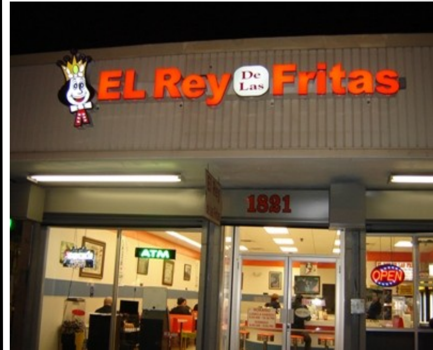
El Rey De Las Fritas

At la ventanita, this is a battle older than your abuela: empanadas vs. pastelitos. Both can be salty and sweet, both can be filled with a variety of items like guava, cheese, beef and spinach. The difference lies in the crust and cooking techniques as empanadas use a heavier dough and can be both fried and baked; while the pastelito is lighter and flaky and only baked.