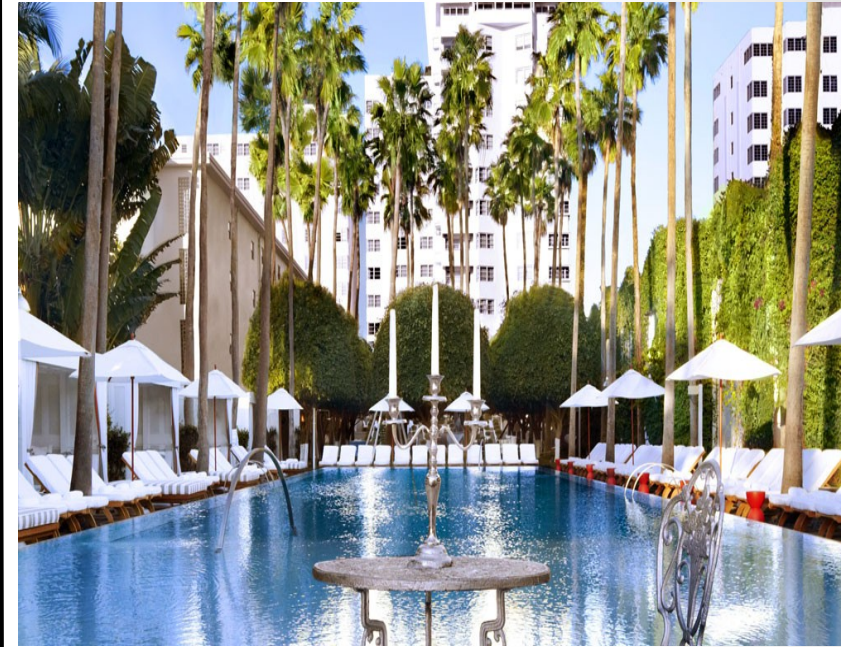
Delano Hotel, Miami

Delano is the hotel that changed South Beach forever. Designed by Philippe Starck, Delano South Beach balances eclectic details with grand public spaces that are playful, elegant, quietly theatrical and filled with all-night energy - proof that the new rules of chic are simplicity with a crisp, clean and modern sense of ease. Delano's signature South Beach restaurant, Bianca, features an inventive Italian menu offering local, farm-to-table organic ingredients, while Umi Sushi and Sake Bar provides a casual dining experience, perfect for group dining. Sip one of the infamous cocktails and enjoy people-watching at the sophisticated Rose Bar. Delano Beach Club is the ultimate in poolside luxury.