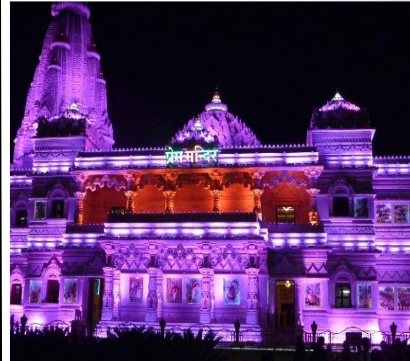
Prem Mandir at Vrindavan, Mathura