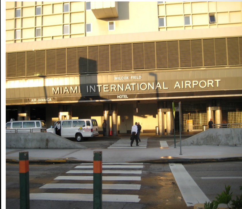
Miami International Airport

By Shuttle : There is a shuttle that will take you where ever you need to go from MIA airport and is called Super Shuttle Miami. Approach any of the blue vans located on the outer island. They also have guest services representatives in the airport wearing a blue Super Shuttle shirt.