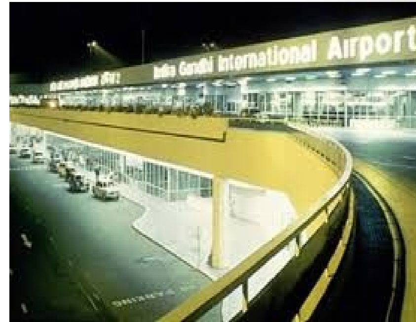
Indira Gandhi International Airport, Delhi

Getting Around : The core of Vrindavan is congested as it is an ancient town with thin lanes. The best way to get around is on foot or cycle rickshaw.