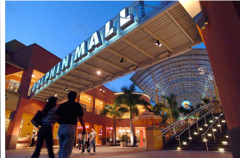
Dolphin Mall, Miami

In the city of south miami, south of coconut grove near the university of miami, colorful streetscapes point the way to dozens of specialty stores in the shops at sunset place. Spacious piazzas set a soothing tone for shopping, dining, movie-going and martini-sipping. While readers browse in barnes & noble, fashionistas can check out the armani exchange, banana republic, urban outfitters and a host of other stylish shops, or skip shopping in favor of the fun waiting at the gametime entertainment zone, the amc sunset place 24 with imax theatre, and splitsville luxury lanes & dinner lounge.