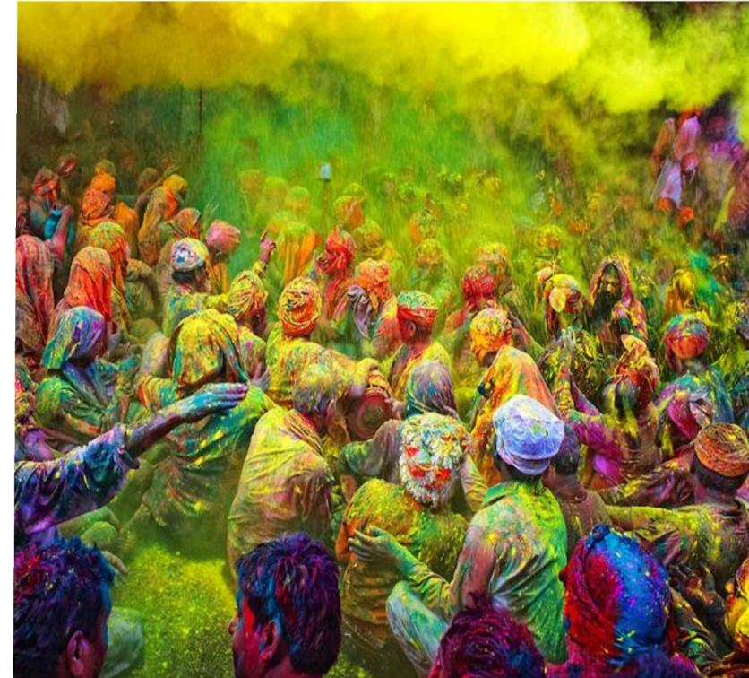
Holi Festival at Vrindavan, Mathura

Where: Vrindavan, Mathura district of Uttar Pradesh.