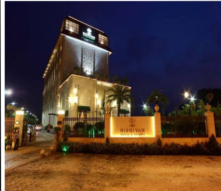
Nidhivan Hotel Exterior View

Contact Tourmet to get upto 25% discount on HOTEL BOOKING.