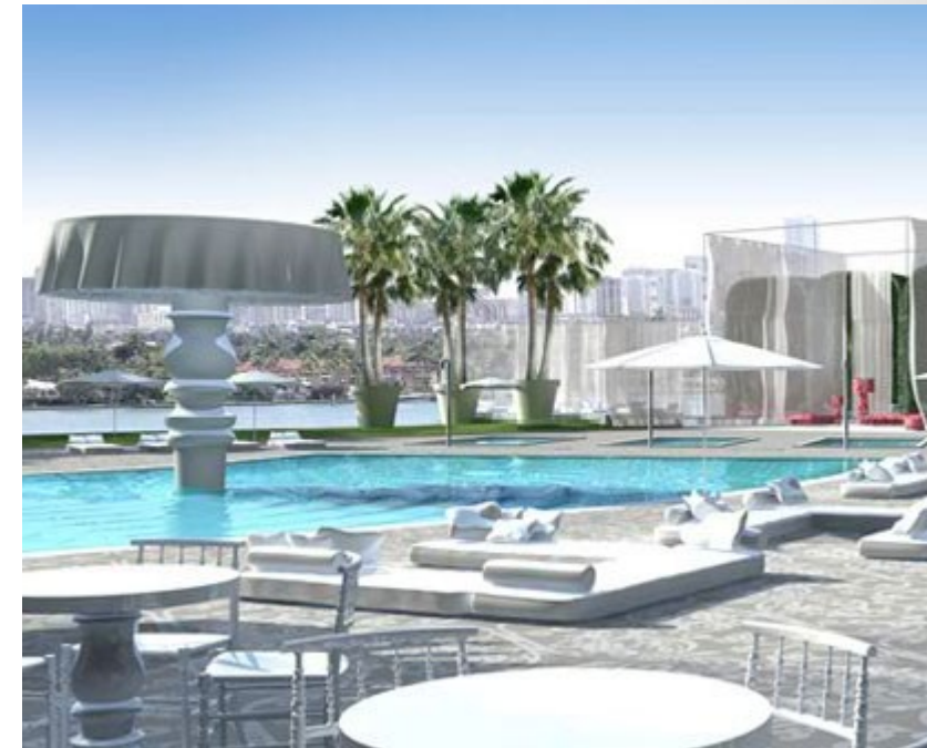
Mondrian South Beach Hotel, Miami

Mondrian South Beach captures all the heat, intensity, energy and vibe of the original Mondrian in Los Angeles. Revolutionary Dutch designer Marcel Wanders' whimsical and visionary style for the hotel is an homage to "Sleeping Beauty's Castle." In the soaring lobby, where the scene is about "see-and-be-seen", floor-to-ceiling windows offer spectacular views of the Bay, while the eye is drawn to the masterpiece of the room—an iconic, signature "floating staircase." Prepare for a night out at our signature South Beach spa, aqua, or work off last night's indulgence at our world-class gym. Enjoy a meal indoors or al fresco at our a restaurant focused on locally sourced ingredients, or a specialty cocktail at Sunset Lounge. Shop at our Semi Automatic machine for unique items and necessities, curated by BASE. Also on site is a private marina exclusively for guests' use. Located on newly-fashionable West Avenue, Mondrian is just minutes from the center of South Beach, downtown Miami, Miami Design District, Wynwood Arts District, Venetian Causeway, Lincoln Road, Ocean Drive and Espanola Way.