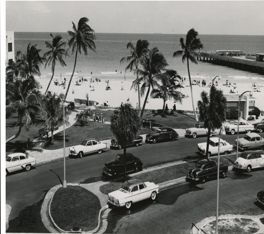
Historic photo Miami, USA

Miami cities of such youth can claim a history as eventful, significant, and tumultuous as that of Miami. From its beginnings as a tiny settlement along the Miami River to the robust international city of today, Miami has represented for multitudes of new residents a place to begin anew, a gateway to a better tomorrow. And at no time has this been more true than the present. The story of Miami begins more than 10,000 years ago with a settlement of Paleo-Indians along the edge of south Biscayne Bay near today's Charles Deering Estate. Many millennia later, Tequesta Indians entered the lush, subtropical area and built settlements stretching from the Florida Keys to Broward County, with the largest concentrations along the north bank of the Miami River and on Key Biscayne.